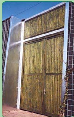
Service & exit door